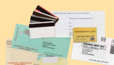
Thick and stiff documents Stuffed Envelopes • Plastic Cards • Cardstock