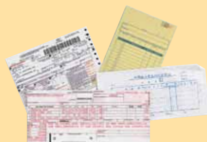
Fragile and thin documents Rice Paper • Airbills • NCR Forms

The Kodak Ngenuity Scanners’ innovative design packs in smart features that make a big impact in helping you spend less time sorting paper, adjusting scanner settings and worrying about image quality, and more time streamlining your document workflow and boosting your bottom line.