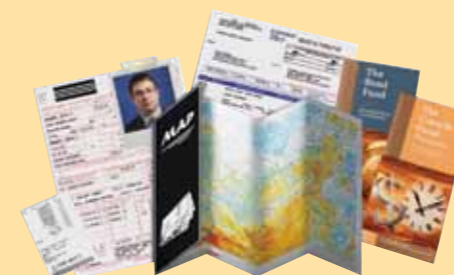
Exception documents Receipts • Folded Documents • Photographs