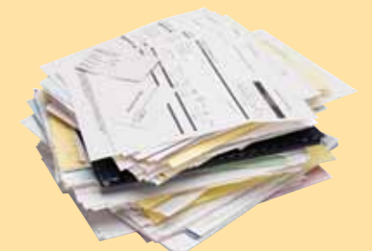
Legal and A4 size documents Contracts • Forms • Invoices