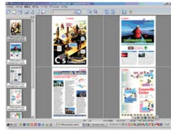
Thumbnail images / Multi-window images

An added straight paper path enables smooth scanning of plastic cards and thick documents