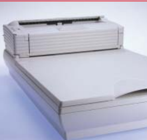
DR-2580C pictured with optional Flatbed Scanner Unit.

Scan everything from business cards and checks to documents up to A4/Legal-size with the remarkably compact, remarkably versatile DR-2580C. Featuring 24-bit color, fast duplex scanning, "one-touch" job buttons, a detachable flatbed option, and much more.