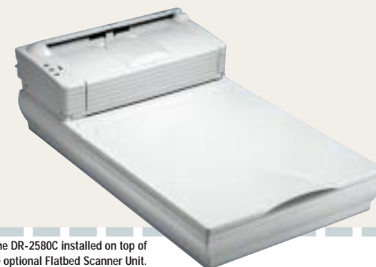
The DR-2580C installed on top of the optional Flatbed Scanner Unit.

The DR-2580C can be paired with an optional Flatbed Scanner Unit to enable the scanning of documents that are too thick or fragile to go through the document feeder. With a double-hinge cover design, scanning books and other bound documents is a breeze. And because the easy-to-install flatbed is detachable, you can always choose to add the option later to satisfy your office's growing needs.